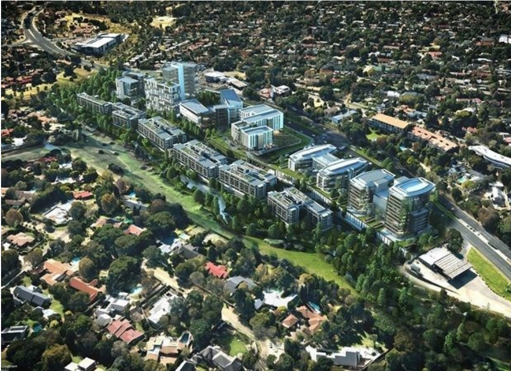
Sandton Gate render.

The impact of buildings and construction on the environment is astounding, with the built environment currently accounting for 20% of the world's water usage and 40% of its electricity. The good news is that green buildings can reduce global carbon emissions by up to a third. South Africa is one of the global leaders in green building. Here's an update on where green building is at in SA.