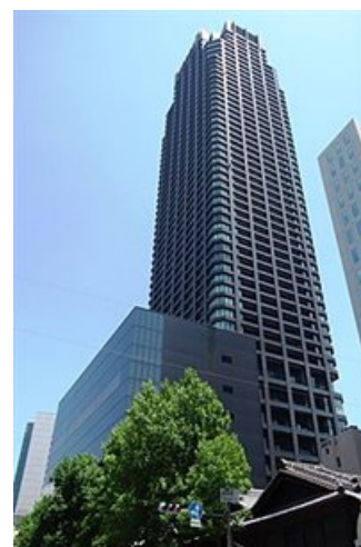
The Kitahara building, the tallest residential tower in Japan, is built with bendable concrete for earthquake resistance.

In New York and New Jersey , lawmakers have proposed state-level policies that would provide price discounts in the bidding process to proposals with the lowest emissions from concrete. These policies could serve as a blueprint for reducing carbon emissions from concrete production and other building materials.