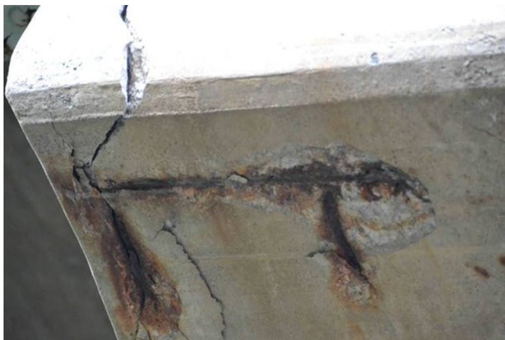
A lot of North American infrastructure is in a state of disrepair.

Nationally, the crumbling of federally managed infrastructure has been a steadily growing crisis. The Biden administration could start to address those problems, as well as climate change, and create jobs through a strategic infrastructure