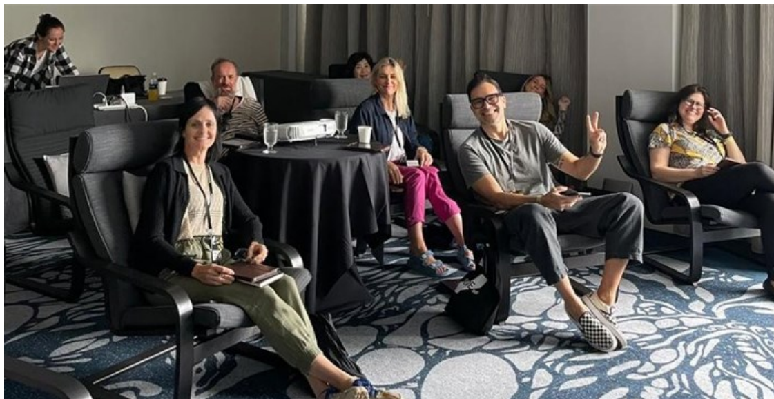
The judging room

We watched, thought “I wish I had done that”, debated, ate choc chip cookies again and again, fell head over heels in love with craft and discussed some of the best advertising in the world. We then closed each day sipping pina coladas on the beach.