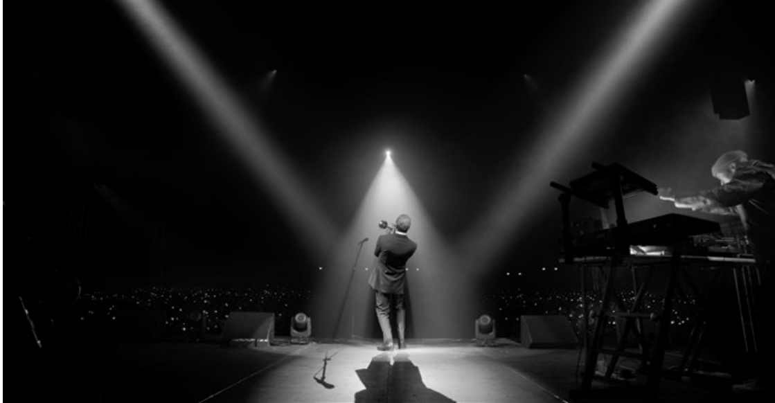
Image supplied. The latest in Allan Gray's catalogue of ads, Everything comes around

The latest in Allan Gray's catalogue of ads, Everything Comes Around is a black and white film that portrays the life of a jazz musician from the late 40s whose commitment to his craft is unwavering, even as musical trends come and go.