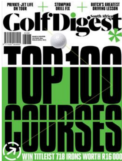
Golf Digest, March 2018, Top 100 2018 cover

In February 2018, New Media will release the 268th issue of Golf Digest , making it one of the country's longest running sports magazines. The March issue (on shelf from 19 February) is the iconic Top 100 Edition. The prestigious course ranking was first published in 1998, and this year will mark its 20th anniversary.