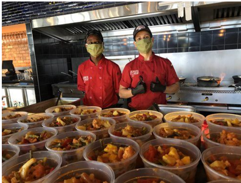
Saigon Suzy in Parkwood