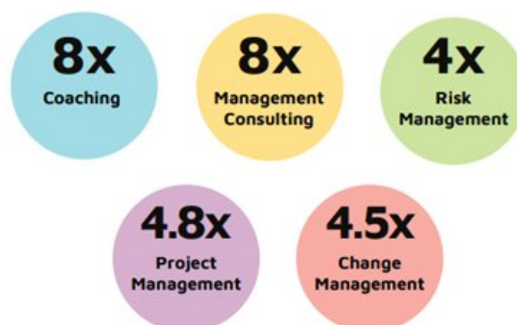
Skill growth in Africa for Y'21

What's also interesting is the skillsets that are in the highest demand right now. For insurance and management consulting, data analytics is a huge priority; while for the Big 4 and investors, it's legal and regulatory skills. Drilling down into the insurance market, the other priority skills include actuarial, business intelligence, accounting and data architecture; while for management consulting its data engineering, data science, solutions architecture and data visualisation. For the Big 4, legal and regulatory was joined by Murex, quantitative analytics, treasury and credit risk; while for investors, it's programme evaluation, risk management, market research, and programme management.