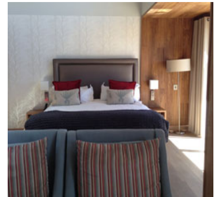
A modern room with all you could ask for – everything from a desktop computer and giant TV set to a Nespresso machine.

Initially built as a Cuban diplomatic residence, it expanded its guesthouse status (for which it was awarded Best Guest Lodge in the 2012 Tshwane Tourism Awards) into Boutique Hotel and recently opened a new wing of rooms. We were in their second-floor presidential suite, which is a fabulous, modern room with all you could ask for - everything from a desktop computer and giant TV set to a Nespresso machine. I loved how the high windows were shaded with automatic blinds and having a glass sliding door and outside veranda with table and chairs is a bonus.