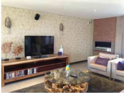
Service and comfort are the watchwords.

Menlyn Boutique Hotel was initially built as a Cuban diplomatic residence - a good start, on which has been built a real gem of a hotel.