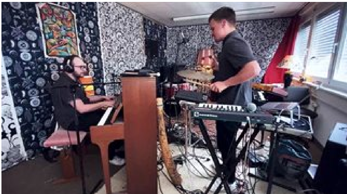
Seba Kaapstad – Virtual Jazz Unplugged Session (Live collaboration between South Africa and Germany)