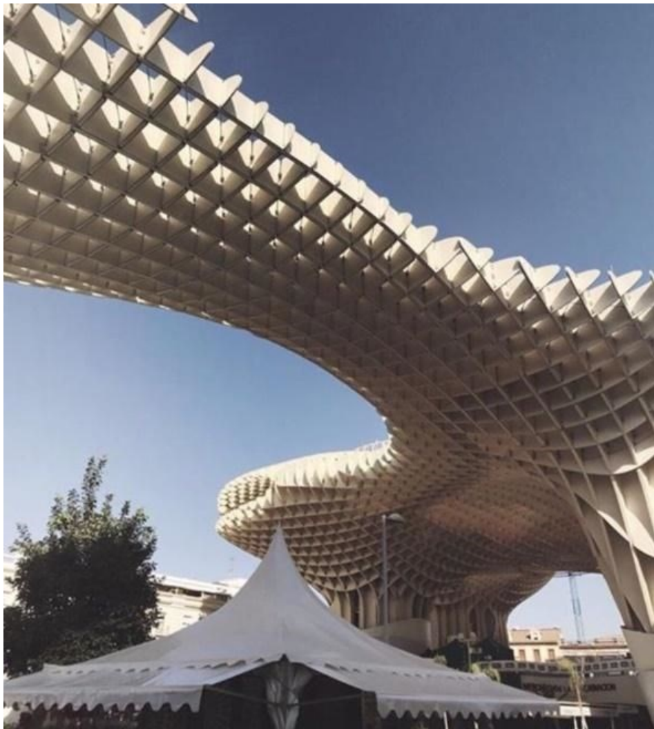
Metropol Parasol, Seville, Spain, ©Frans Bergh