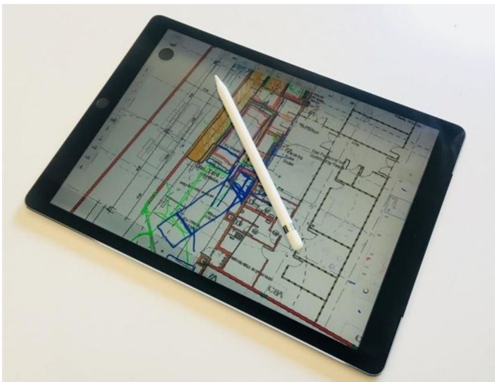
Stylus and tablet set, Ipad Pro and Pencil, ©Louis Cottle

Some of the benefits include less paperwork and expedited iterative design processing. It promotes a culture of clear communication by offering quick sketching and effortless sharing of revision notes.