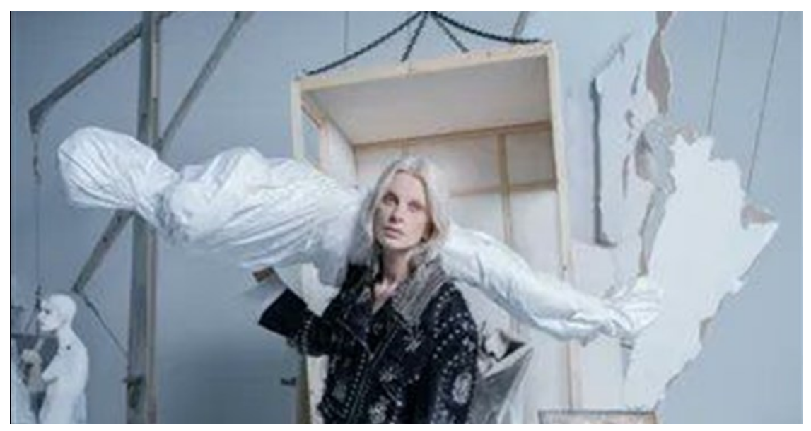
The ad has been removed from social media.

On Monday, Zara removed an advertising campaign featuring mannequins wrapped in white from its website and app.