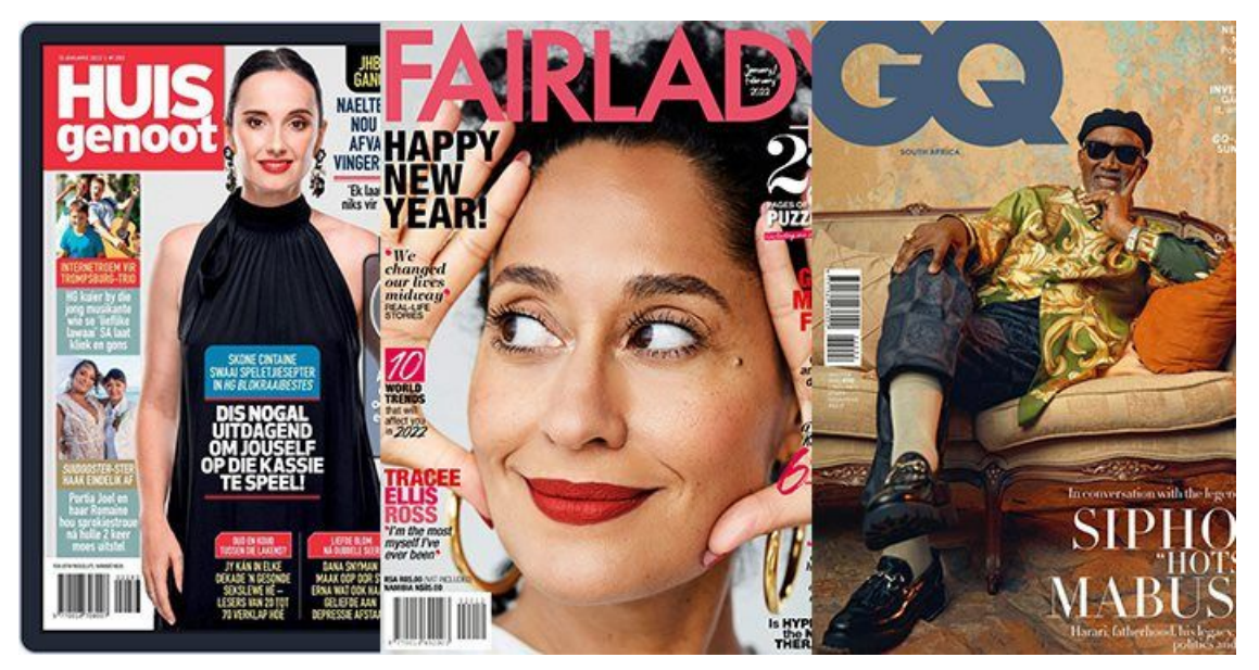
The hero of the Audit Bureau of Circulations (ABC) of South Africa Q1 2022 is digital magazines

With a steep increase from 4,510 to 125,912, the hero of the Audit Bureau of Circulations (ABC) of South Africa Q1 2022 is digital magazines.