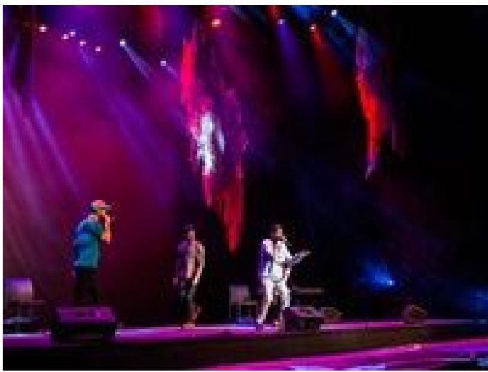
For more, visit: https://www.bizcommunity.com