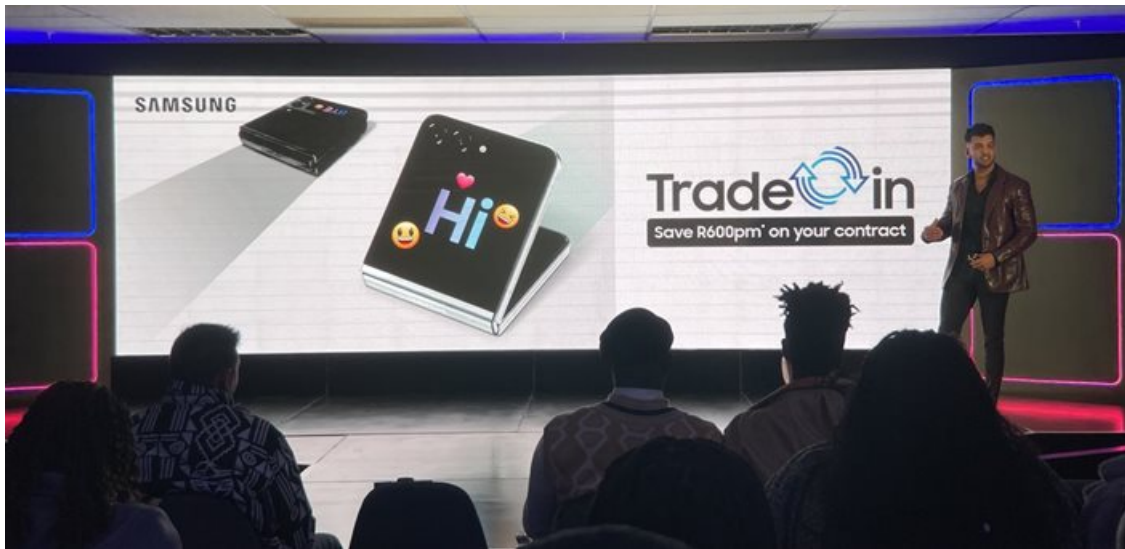
Samsung trade-in deals include contract price reductions.

Pre-orders for Galaxy Z Fold5 and Flip5 open next week and there are numerous trade-in offers available for early buyers.