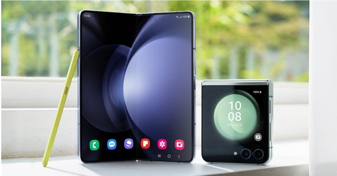
Samsung Galaxy Z Fold5 and Z Flip5.

Samsung South Africa hosted local media at Cracker Zac's in Rosebank for the unveiling of the new updates to its line of foldable smartphones. The biggest change for the 2023 Galaxy Z Flip5 and Fold5 are the Qualcomm Snapdragon 8 Gen 2 processor (inside the Galaxy S23 line as well), a new hinge design that allows for a more compact fold, and the Flip5 gets a bigger cover display.