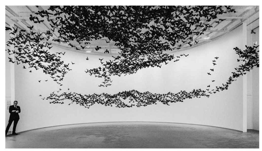
Cai Guo-Qiang's porcelain bird installation (10,000 gunpow der-blackened porcelain starlings) suspended at the National Gallery of Victoria, Melbourne.

From his early training in stage design to his exploration of multiple mediums not only for artistic expression, but also as commentary on contemporary social issues, Cai's involvement in diverse fields reflects the same multidisciplinary, boundary-defying spirit that Noguchi embraced.