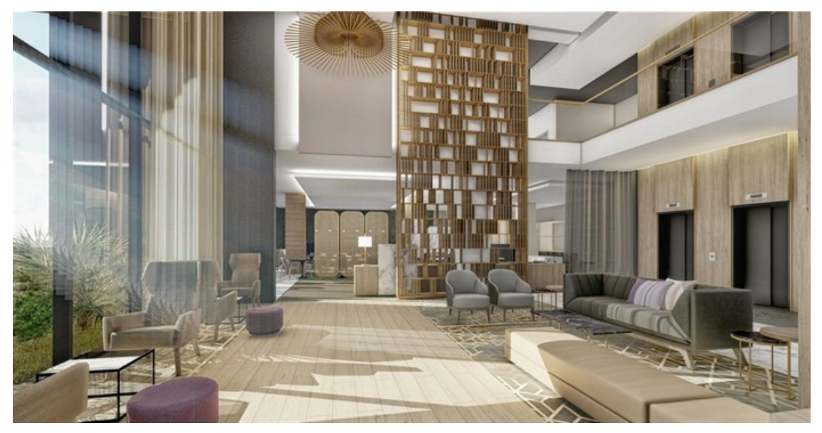
Radisson Blu Antanananarivo

The Radisson Blu Hotel Antananarivo Waterfront and the Radisson Hotel Antananarivo Waterfront will be ideally positioned in a central location at the crossroads of the city center in the main business and commercial district. With three entrance gates, the hotels will have access to Antananarivo International Airport, less than 30 minutes away.