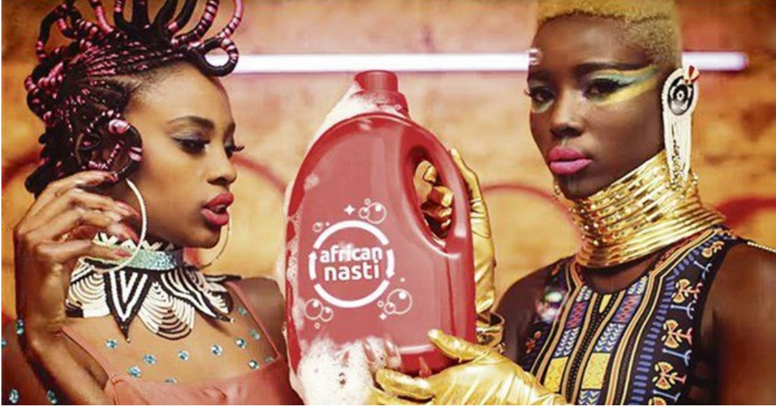
Screen grab from the ad.

A huge fail for your billboard outside the Wanderers featuring the name 'Rabada', Web Africa. Speed over to collect your Onion.