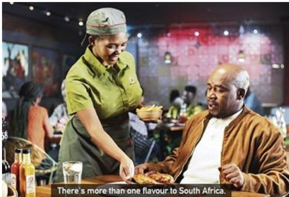
Screen grab from the ad.

They are ad people after my own heart because they have a go at some of the pretentious ads, which seem to be cluttering up our TV spaces.