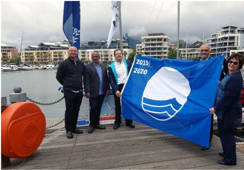
Blue Flag raising ceremony at the V&A Waterfront

Sixty-four Blue Flags were awarded at the 2019/20 launch of South Africa's Blue Flag season, including 45 beaches, nine marinas and 10 sustainable tourism boats across South Africa. The season officially opens on 1 November 2019.