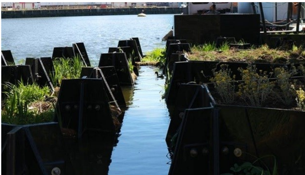
The floating park has provided habitat for waterfowl and insects.

It's not free for others to take and use it, either before, during or after collection, including by the employees of the waste management services. In one legal case, waste management workers for a corporation were convicted of stealing goods from bins collected in the course of their duties. Once waste is collected, it becomes the property of the local authority responsible for managing the waste.