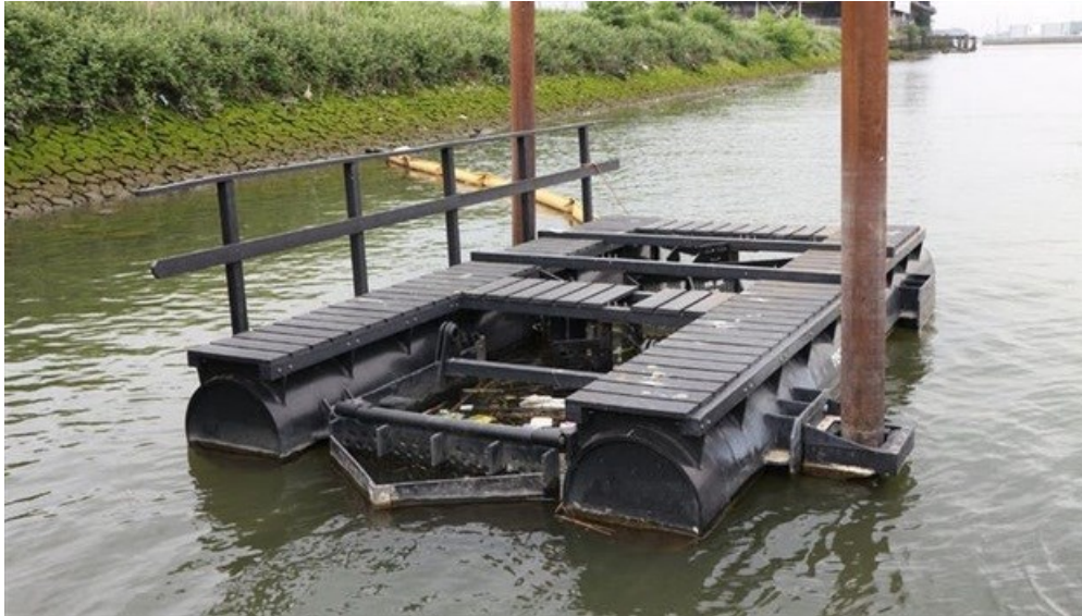
The litter trap collects floating plastic waste and is then emptied.

A 140 square metre prototype was opened to the public in July 2018. It's hoped that five more plastic litter traps can be added to the river, creating an island of at least 190 square metres. If successful, similar islands could be built worldwide, with research ongoing in Indonesia .