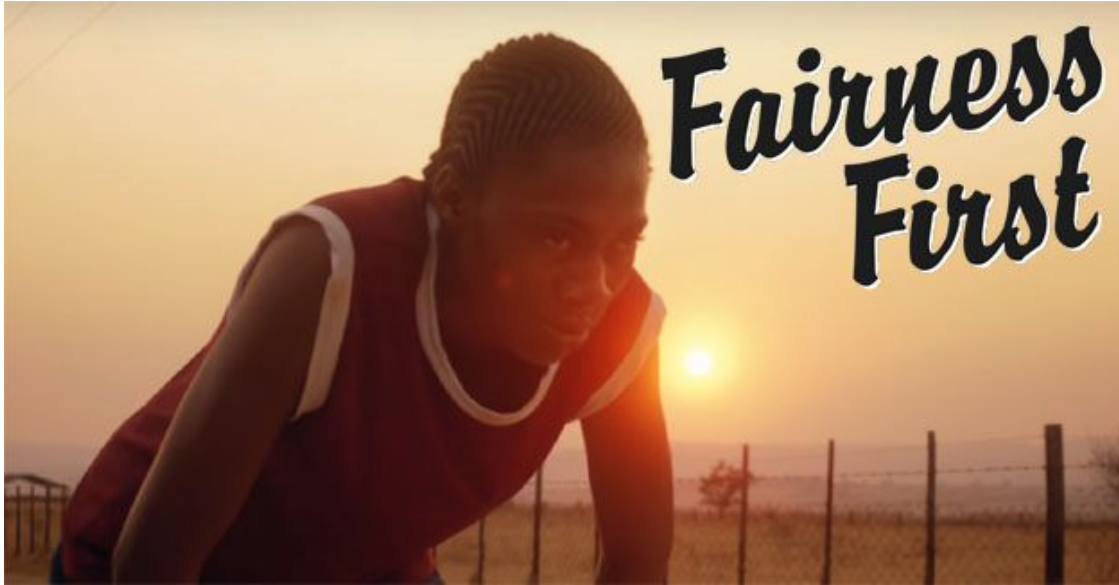
A screen grab from Nike's ad, featuring Caster Semenya.

Nike's Dream Crazy campaign has won favour across the globe, having just scooped up top honours at the One Show Awards in New York. Caster Semenya, who features in the campaign, has also further proved her place on the winner podium.